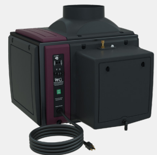
Optional Integrated Humidifier

The Ducted Split system features the fan coil unit and the condensing system. Both units were designed by Wine Guardian, ensuring that they work together properly.