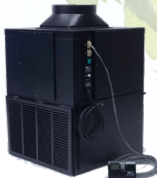
Vertical ducted unit