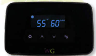
Remote user interface control system displays temperature in °F or °C