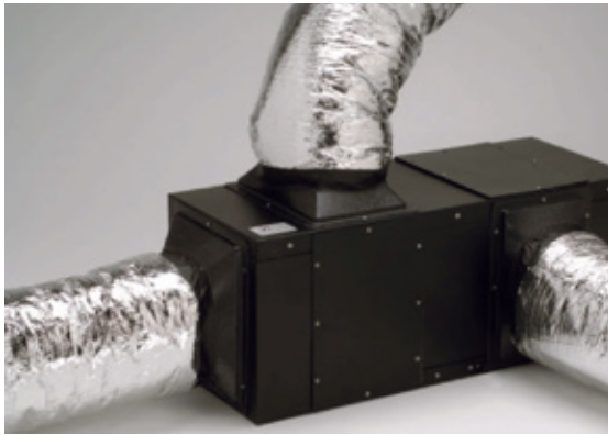
Ducted system with installed duct work